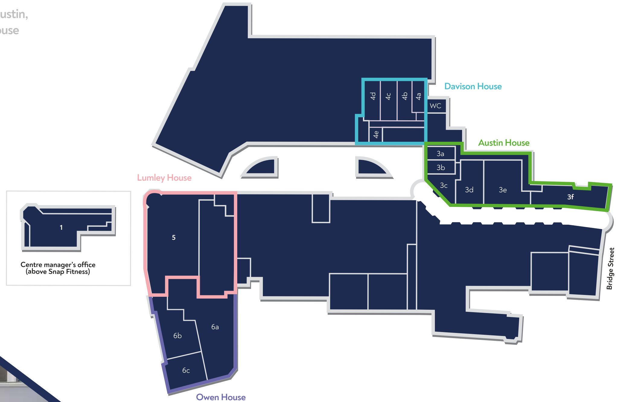
1 Centre manager's office (above Snap Fitness)